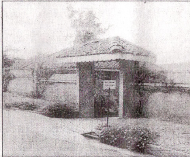
The entrance to the Indus Valley Ayurvedic Center.

The centre has been designed on the ancient principles of Vasthu, the Indian science of building construction. Antecedent of feng shui the functional aspects of IVAC is fashioned in a way to accommodate life's basic elements through various traditions like Earth represented by herbs used for therapies, Fire as of ethnic lamps wind through aromatherapy and Water in the form of decoctions and the tempting swimming pool reflecting the sky above. Around 120 employees are working