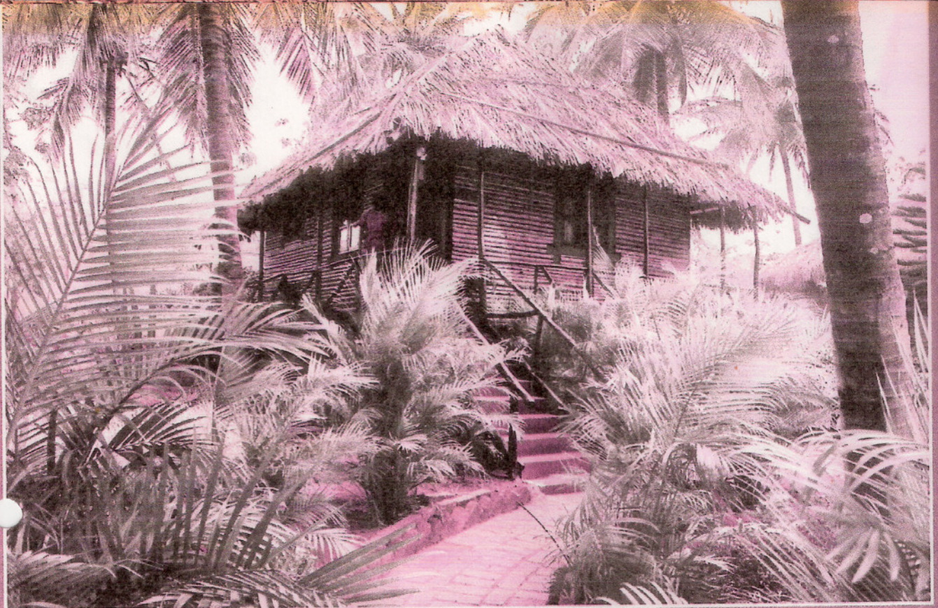
A thatched roof villa at the Indus Valley Ayurvedic Centre at Mysore