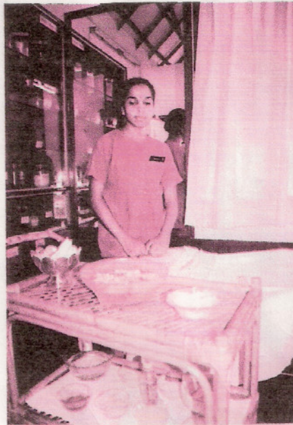
Zen-like simplicity in the massage room

Everybody, we were told, gets the body he or she deserves. We entrusted our over-indulged bodies and mental well-being to the young therapists at IVAC which was